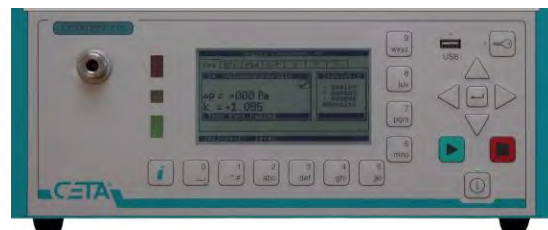
Fig. 4. Leak tester type CETATEST 515 for the leak test of encapsulated test parts with small volume.

With such an optimized instrument like the leak tester, type CETATEST 515 in the variant "closed components, high resolution" (see Fig. 4), the assembly of microparts can be tested, too. The volume which can be filled with air can be taken as a measure to detect assembly defects like a missing o-ring. In a test part, which has a fillable volume of 20 cm 3 and which can be filled directly, a volume difference of only 0.03 cm 3 can be detected by using a positive relative pressure of 900 mbar. This corresponds to the volume of an o-ring of 12 mm diameter and 1 mm cross section.