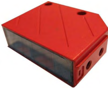
Fig. 2. Photoelectric sensor as an example for a encapsulated test part.

Encapsulated test parts, like most of the sensor types, cannot be filled inside with pressurized air. A typical example to demonstrate this test method is an encapsulated photoelectric sensor (see Fig. 2). These types of test parts are placed in a hood which encloses the test part as closely as possible. The hood is pressurized. The temporal pressure decay of the pressure in the test part is measured. This type of test is called "closed component test" or "hood test".