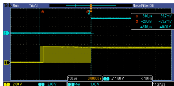
Figure 3, CM1608F0-AERO-GMC, clock drift

Figure 3 shows that the clock drift for the CM1608F0 GMC with OCXO as oscillator from OnTime Networks after GPS lock is lost, is less than 320µs over a time period of 60 minutes when the temperature is cycled from: -40°F/-40°C to 203°F/95°C. This means clock hold-over capability better than 0.1ppm.