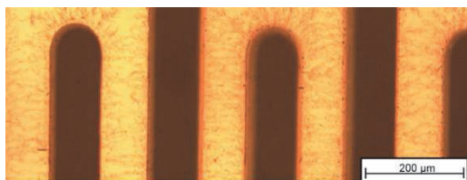
Fig. 1. Optical microscopy picture of MWCNTs deposited between electrodes

The target gas was injected into a dilution system. Before each exposure to a given benzene concentration, the sensor was first stabilized at the nominal heating voltage under a carrier gas (nitrogen or air) until the electrical resistance signal reached a constant level. The sensor was then exposed to benzene during 25 min, with the electrical resistance changes measured all along the benzene exposure. All tests were performed under a total flow rate of 300 sccm. The sensitivity, calculated according: (R-R_0) \times 100/R_0 , with R_0 , and R the resistance under carrier gas and benzene respectively, was measured versus time.