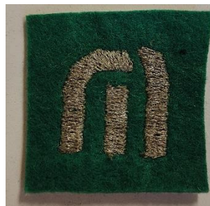
Fig 1. Embroidered electrochemical sensor with 3 electrodes. From Left to Right: CE, WE and RE electrodes.

where the longest electrode is the counter electrode (CE) the center electrode is the working electrode (WE) and the right electrode is the reference electrode (RE). Figure 1 shows the embroidered electrochemical sensor.