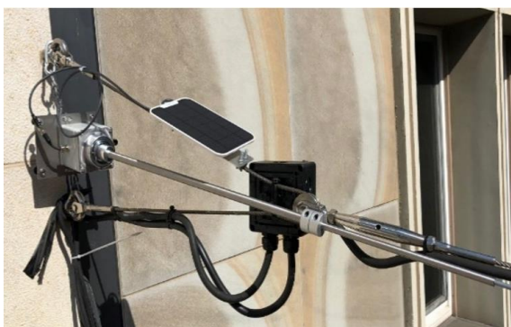
Fig. 3. Developed MAUS-SID applied to line angle monitoring of wall anchors with constrained power