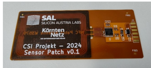
Fig. 2. Developed NFC-based magnet field measurement sensor patch.

As the sensor patch is wrapped around the cable, the printed circuit board (PCB) comprises a 300 \mu\text{m} thick flexible polyimide. The cable's shielding is conductive; therefore, to enable NFC communication "on-metal", the antenna must be electrically separated, which is realized using a ferrite antenna of the type W3509 of Pulse Electronics. To establish near-field communication (NFC), the NTAG 5 link IC of the type NP5332 from NXP Semiconductors is implemented. It enables the connection to any sensor chip featuring an I 2 C interface. The magnetic field is measured with a TLI493D sensor chip of Infineon. Figure 2 shows the realized sensor patch.