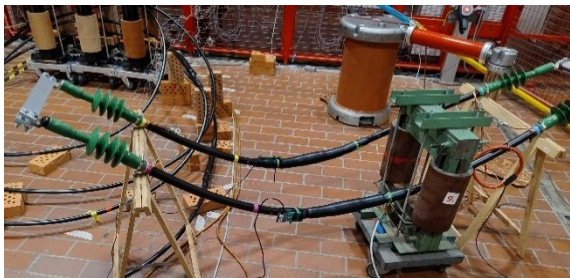
Fig. 3. Measurement setup within the high-voltage laboratory.

Two medium-voltage cable samples of two meters in length were prepared, with the sensor patches integrated for testing. These two pieces were connected in the measurement setup, forming a short circuit loop. A plug-through transformer is used to generate the current flow, and an external Rogowski coil controls the current level. A high-voltage transformer generates the 11.55 kV, supplied to the connecting part of the cables forming the loop. The setup is shown in Figure 3. Commercially available NFC reader evaluation boards are used to read out the sensor patches. In this case, it is the RE12 development kit of Silicon Craft Technology.